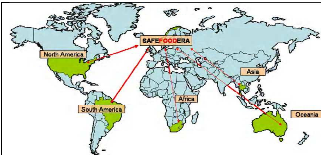
Figure 3: Future Ideal SAFEFOODERA World-Map

It seemed reasonable to limit SAFEFOODERA's engagement beyond the European borders. Therefore it was planned to install "hubs". We were looking for partners in each continent who should participate in SAFEFOODERA but should also bring in their knowledge and experiences from their regional networks. The future SAFEFOODERA world-map should ideally look like the following: